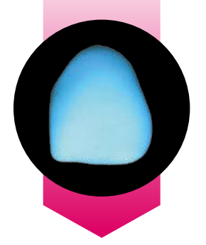
\rangle \, {\it fluorescence} \, \, {\it too} \, \, {\it high} \,

Perfectly matched and homogeneously applied fluorescent and glaze agent > VITA AKZENT Plus FLUOGLAZE LT